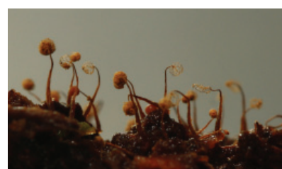
Cribraria splendens