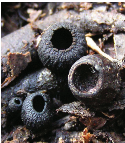
Plectania campylospora (Malcolm McKinty)