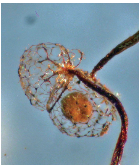
Cribraria splendens - peridial net with spore mass remnants x 40 (P. George)