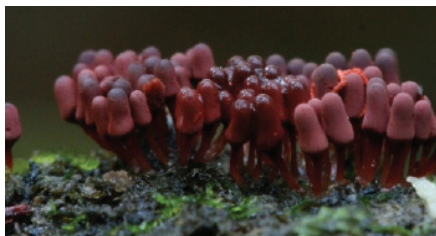
Arcyria denudata