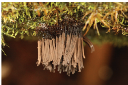
Stemonitis sp.