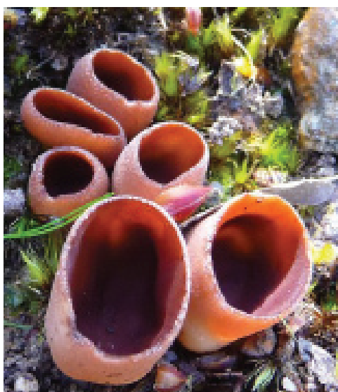
Nothojafnea cryptotricha