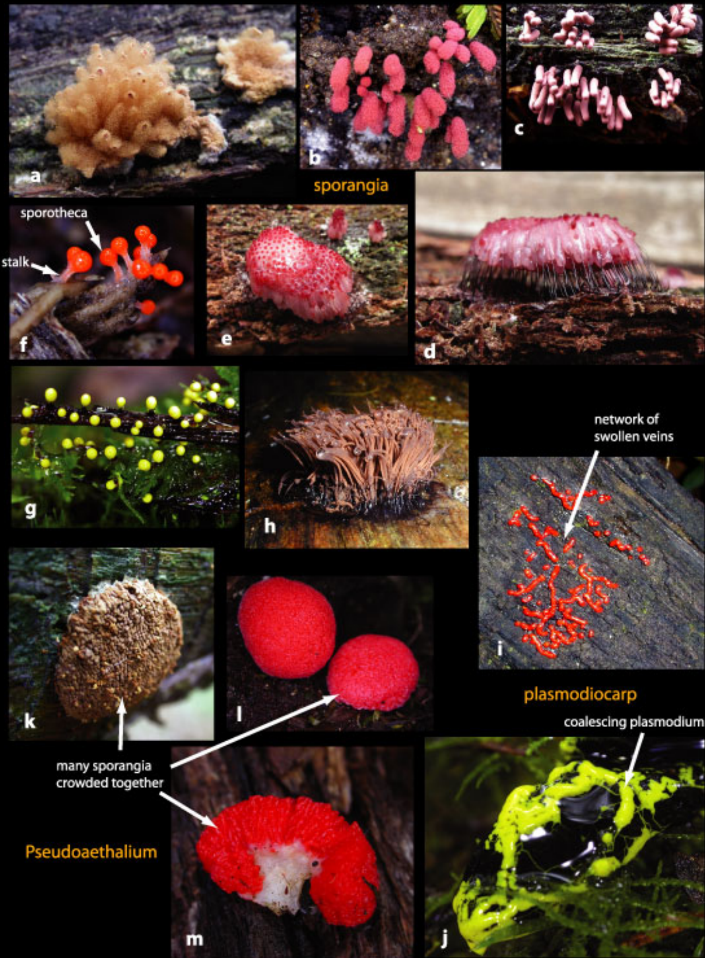
Plate 2. Slime mould fruit bodies: Sporangia. a-h. a. Arcyria sp. (D. Catcheside); b. Arcyria sp. (P. George); c. Stemonitis sp. (D. Catcheside); d-e. Stemonitis sp. (P. George); f-g. unknown (P. George); h. Stemonitis sp. (P. George). Plasmodiocarp i-j. unknown (P. George); Pseudoaethalium. k-m. Tubifera sp. (P. George).