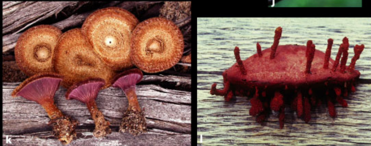
Plate 4. a. Entoloma sp. b. Nidula niveotomentosa ; c. Cyathus striatus ; d. Lysurus mokusin ; e. Cotylidia undulata ; f. Podoscypha petalodes ; g. Parasitised beetle ; h. Parasitised sphingid moth ; i. Parasitised wasp ; j. Parasitised fly ; k. Panus fasciatus ; l. Parasitised Pycnoporus.