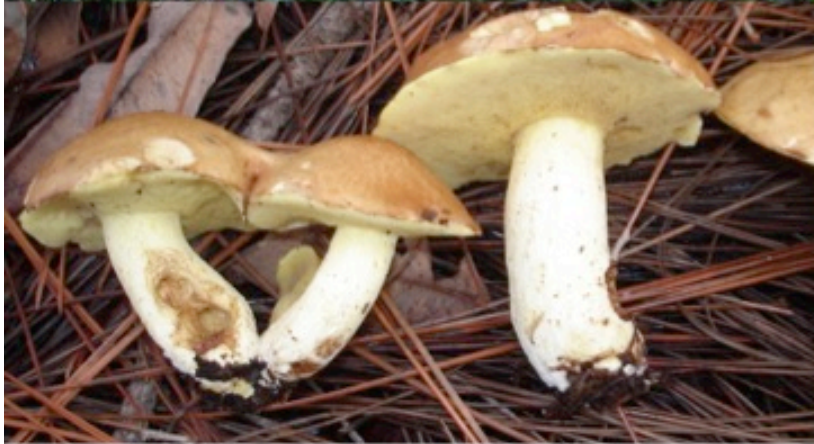
MURU6263_Suillus_granulatus. Western Australia (Bill Dunstan)