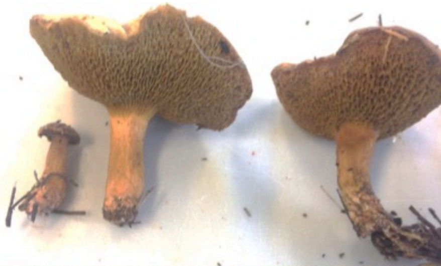
Suillus bovinus Yellowish overall, no veil, no granules, pores slightly decurrent. Introduced from Europe