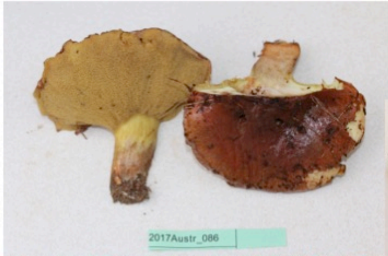
Suillus quiescens pileus slimy, brown, stipe often short, young pores clay coloured; Introduced with radiata pine; very common