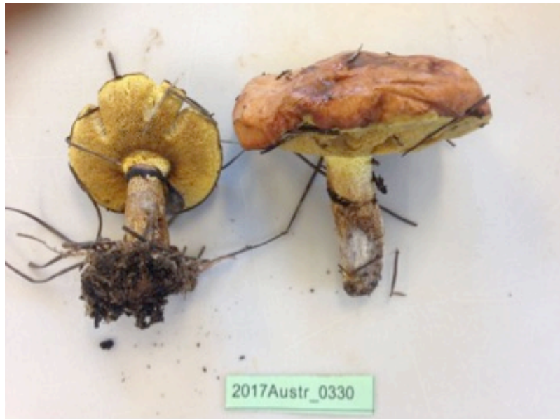
Suillus luteus Common slippery jack; With all pines; veil purple